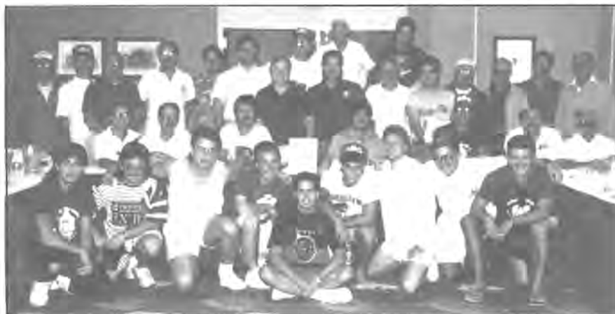
Attendees of the National Council meetings