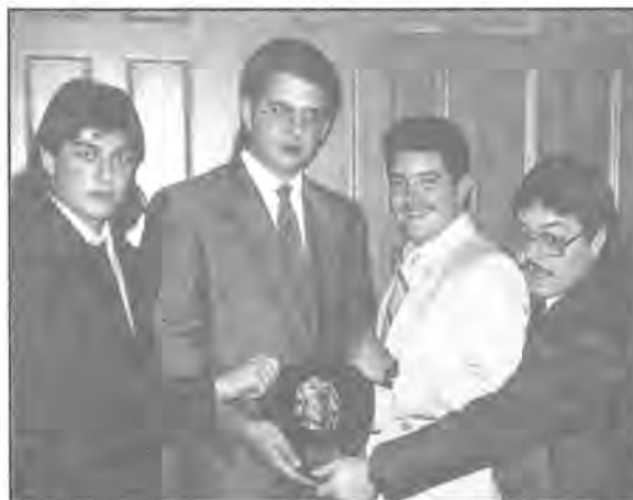
Beta Pi brothers in Lake Placid

In addition to socializing and keeping good relations with the other campus fraternities and sororities, we hold events for the entire student body. Over the past year we held numerous parties in the Rathskeller at the student union building of the University, in order to socialize with all students. Additionally, we partake in the campus Activity Fair to give non-fraternity students a better understanding of what we are all about.