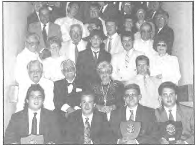
Part of the crowd at the 70th National Convention at the Lake Placid Hilton.