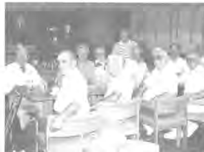
One of the yearly highlights is the annual luncheon shared by Brothers 50 years or longer in the Fraternity. This year 11 showed up to reminisce once more their undergraduate days.