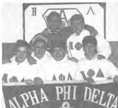
Beta Lambda's Spring Pledge Class of 1989 is shown celebrating after initiation.